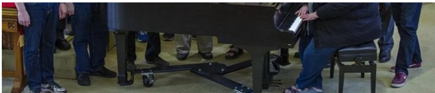
The Brant Men of Song will perform A Concert Recognizing Frontline Heroes on June 11 at 7 p.m. at First Baptist Church in Brantford, Ontario.

The Brant Men of Song are getting back in their groove.